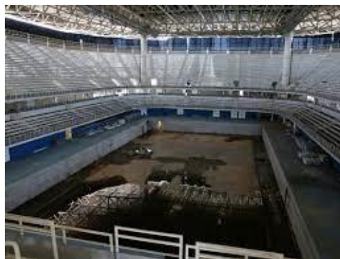
Figure 1 White elephant from Athens 2004

However, despite the heritage associated with the OPG, the model has suffered from increasing threats with a growing disconnect between the expected and realised economic benefits of hosting the OPG (Scandizzo & Pierleoni, 2017) and the increase in direct and indirect costs for host cities (Müller et al., 2022). Faced with the issue of mega-events (Müller, 2015) characterized by stronger local resistance and the withdrawal of several candidate cities (e.g., Boston, Budapest, Rome, Hamburg, Munich), the strengths of the OPG model seem to be counterbalanced by its weaknesses, notably the financial burden of hosting the games and the difficulties of maintaining the Olympic facilities afterwards. First, local organizational costs have been on the rise: Athens 2004 cost €9 million; Beijing 2008 cost €30 million; London 2012 cost €13 million; and Rio 2016 cost €16 million. Second, there is an increase in hidden indirect costs during the event such as security costs, traffic disruptions, congestion costs, and market disruption. Third, there is a rising risk of “white elephants”, those sport structures that put strains on a city and become largely unused after the event.