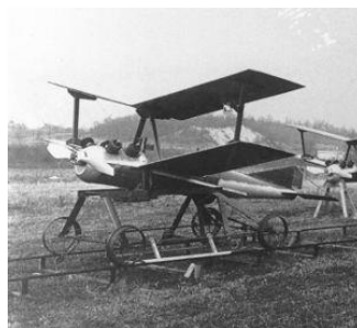
1. Picture: Kettering Bug.

The next important tool was called the Kettering Bug, a development during World War I, but it was not actually deployed in the war. It looked like a two-deck plane, but it didn't have a wheel, it got off a four-wheeled car running on rails.