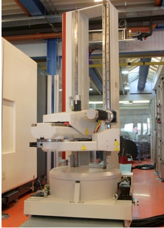
Fig. 3 Robot on a linear track by EROWA

Multi-machine systems are usually handled by one robot, that is, according to the prevalent solutions, moving on a linear track, between the machine tools and storing magazines placed one after the other (Fig. 3).