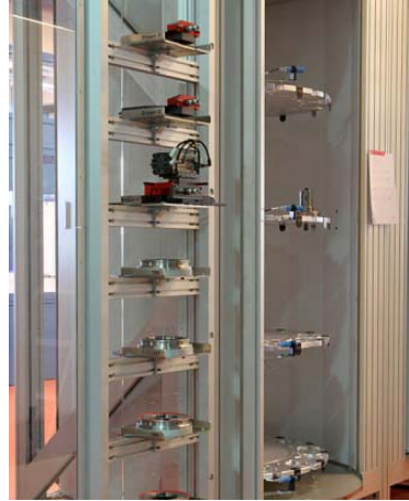
Fig. 4 Fixed racks with robot grippers

The linear track is mostly installed on the floor but gantry track solutions are also known. The robot moving on the track must be robust built, heavy-duty with cylindrical coordinate system or even six-axis, joint arm system.