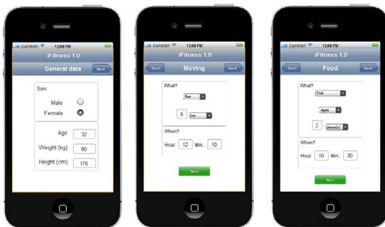
Figure 1. User can give the type of foods and exercise

The application can show a list about the foods and exercises and how much energy burned the user on this day (figure 2.).