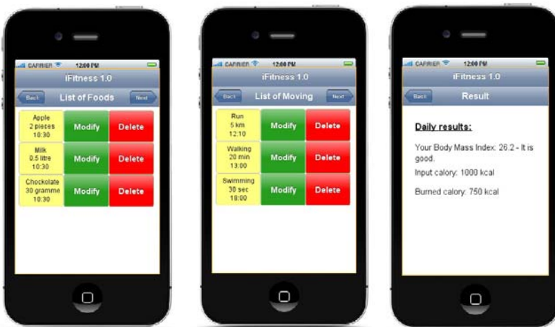
Figure 2. The smartphone make a list of type foods and exercises

The application can show a list about the foods and exercises and how much energy burned the user on this day (figure 2.).