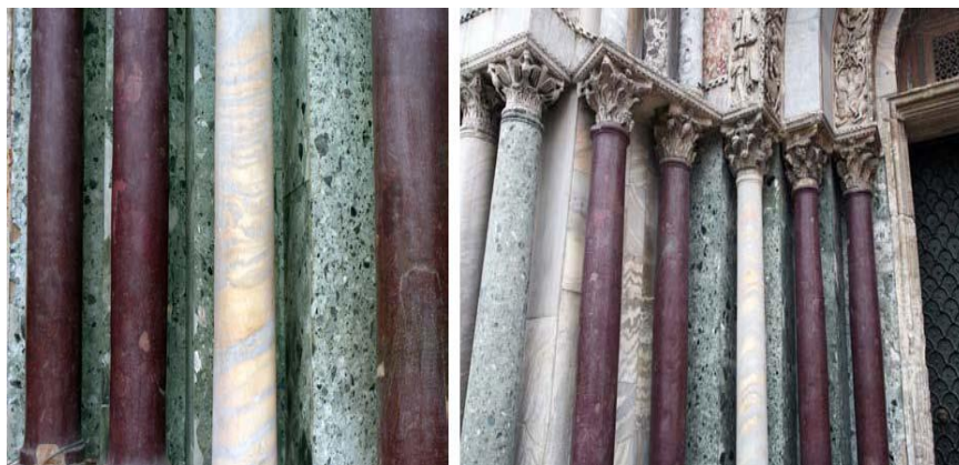
Figure 7: Round marble columns dissolving the surface at the entrance of Basilica San Marco.

The coloured marbles of San Marco Basilica dissolve the visual boundary between the hard surface of the wall and the ample space of the interior. By touch and sight the marble veneers are located on the surface of the walls, yet their fractal patterns, mobile and undulating, seem to pulse, contract and expand beyond the