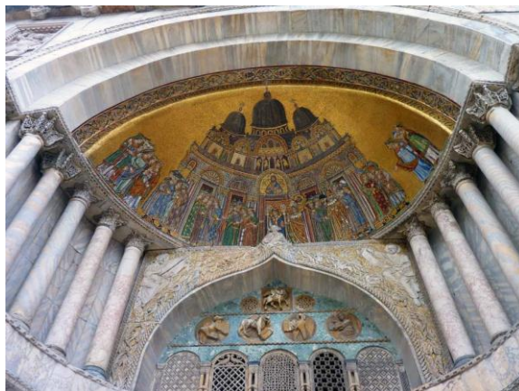
Figure 6: Basilica San Marco porch.

In the pavement of San Marco Basilica, many patterns, especially the circular ones, are constructed with a “field” of pale grey marble rhythmically interspersed by the “figure” of coloured marbles. Figure and field may interchange, but tonal contrast remains. In the sections of polychrome infill, the regular juxtaposition of