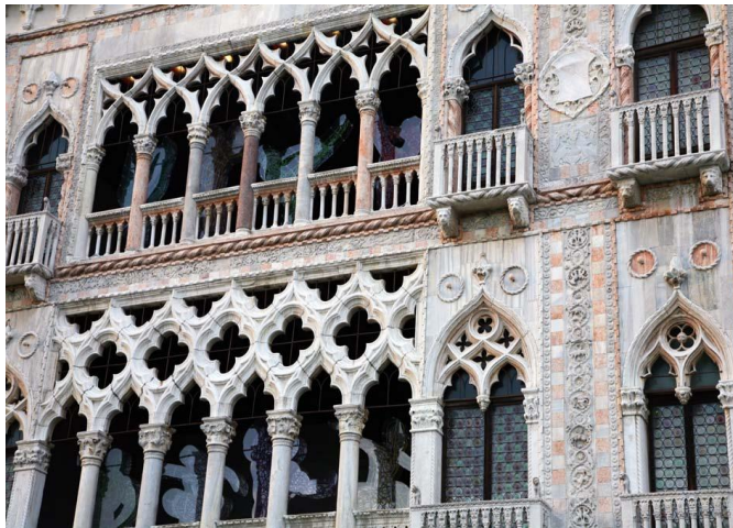
Figure 10: Light and shadow, rose and grey floating colours on a Venice palazzo facade.

In a monochrome urban field the configuration of edges of three-dimensional objects changes as the observer moves and the visual system correlates the changing configuration of objects with the shifting angle of vision. But in a coloured complex field such as San Marco or Hagia Sophia, the patterns in gold or in veined marble are slow to change with the angle of vision. When somebody moves slowly in this type of field, time seems to slow down as the viewer becomes relatively unaware of the change of his angle of vision. This creates a feeling of slower motion within a larger unfolding than in real life.