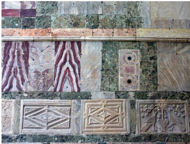
Figure 5: Marble encrustation on Basilica San Marco wall near the entrance of Palazzo Ducale (Photo: Serge Salat).

But not only the lagoon is an ever-changing surface. Buildings in Venice interweave colours in fractal patterns. The façade of the Palazzo Ducale on the Piazzetta for example consists of tiles of white Istrian and orange-red Verona stone set in an interlocking pattern of lozenges. The longitudinal slabs are set