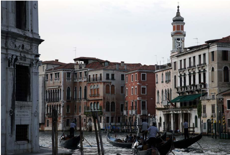
Figure 1: Colour unfolds in the rhythmic beat of time of Venice lagoon.

Colour in cities is a three-dimensional experience unfolding in time. We experience the urban colour dynamics in fleeting scans peppered with momentary fixations. If these scans don't reconstruct a higher form of order, the city appears alienating and meaningless. Meaningful patterns of colours perceived into sequences make the city a four-dimensional experience.