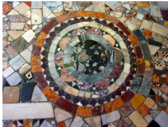
Figure 9: Venice floor patterns.

The general encrustation of marbles and the golden surfaces of San Marco in Venice and Hagia Sophia in Constantinople deny the weight of structures, a quality admired by the Byzantine Procopius in his account of the sixth-century: “Rising above this circle is an enormous spherical dome, which makes the