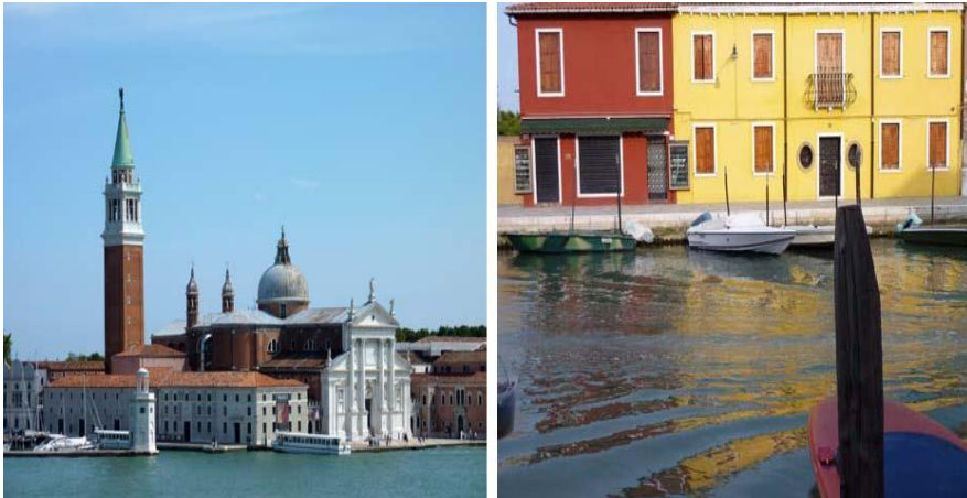
Figures 2 and 3: Venice lagoon changing colour field.