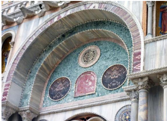
Figure 8: Basilica San Marco marble patterns (Photo: Serge Salat).

Other veneers – particularly the Greek grey marbles – open depths as between layers of clouds. “From a distance the butterfly patterns read as an opening of the heart of things and the spreading of what was inside upon the surface [8].”.