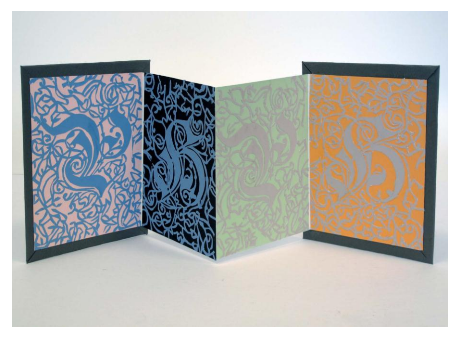
Fig. 2. "Monogram Pattern Book: Bezold" Heidi Eisenberg, 2012, Color-aid paper, 22.9 x 61 cm