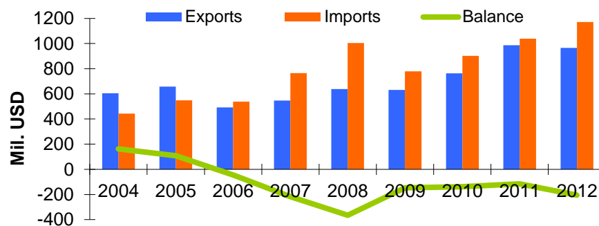
Figure 3 Foreign-trade with agri-food products

Moldova has one of the best fertile soil called chernoziom , and everybody thout that this is an export-oriented country, in the reality it has negative balance in foreign trade as the picture shows below: