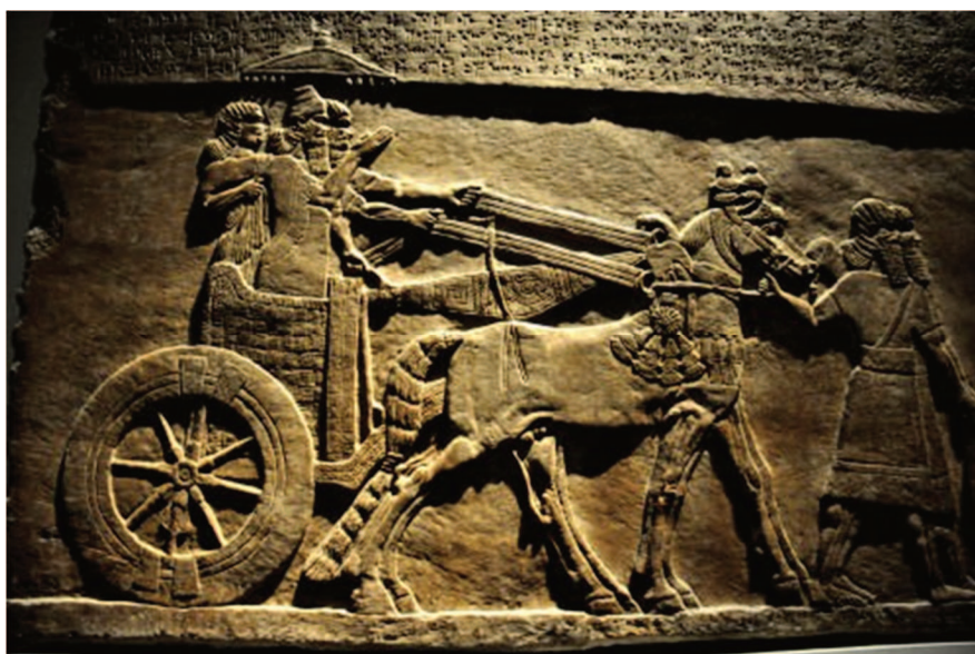
Figure 3. Chariot

The spear was the main weapon, as it could penetrate any armors with extreme accuracy. Most known spear was the sarissa . It had double length compare to the spear. It was also very useful against cavalry.